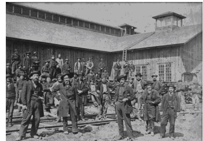
US Rolling Mill in Johnstown- 1864